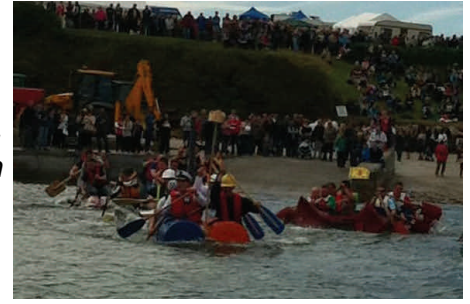
Deerness Boat Show

We'd discussed FOSN having a presence at the shows in order to publicise memberships, projects etc, and with the Boat Show at the Geo on the day following the East Mainland Show on 3 August 2013 this was the ideal time to hire a tent and do it! We managed to gather together a great display of all the current projects, Places and Names, World War 1, the Photographic competition for our 2015 calendar, etc. A lot of interest was the result and we also made a great start to flagging up Something Different Something Deerness , with the selling of Prize Draw tickets.