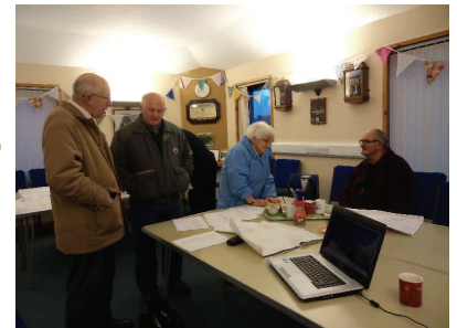
Information Gathering Session